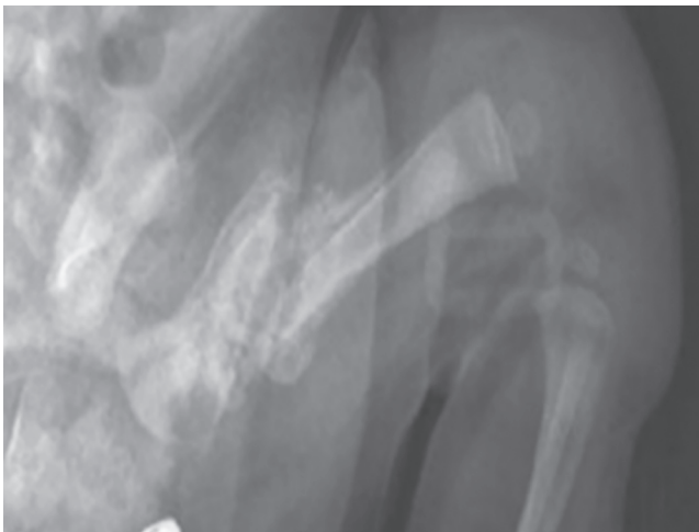
Fig. 3: At 4 weeks