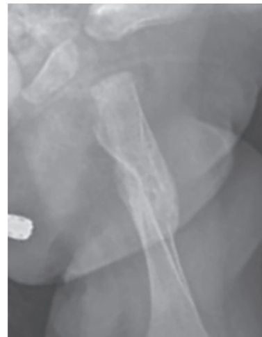
Fig. 4: At 20 weeks

limb length discrepancy, no visible deformity, and active painless limb movements present. Twenty weeks after the birth, both lower limbs were showing a full mobility without any type of any dysmetria (Fig. 4).