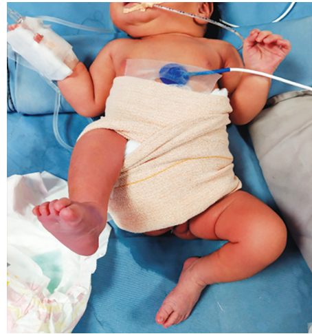
Fig. 2: Treatment